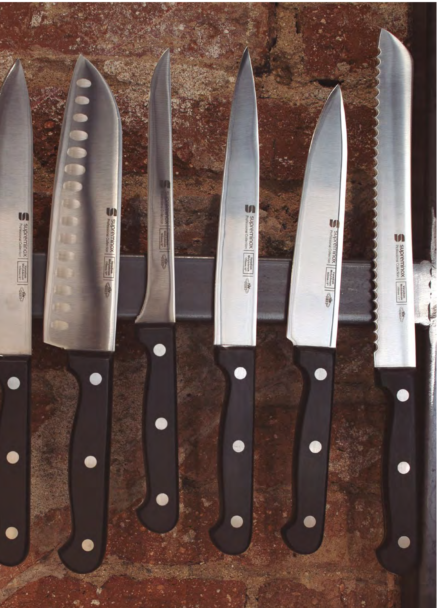
cuchillos profesionales · professional knives · couteaux professionnels